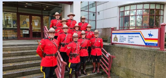
North Vancouver Det. Contingent preparing for parade.