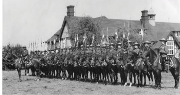
RCMP members ready for parade at Fairmont Barracks. from hunting grounds as it is situated on historic trails which connected First Nation villages along the Fraser River, False Creek and beyond.

First Nation leaders believe the demolition or removal of the building from their lands is appropriate in the spirit of reconciliation as Fairmont represents oppression and rejection