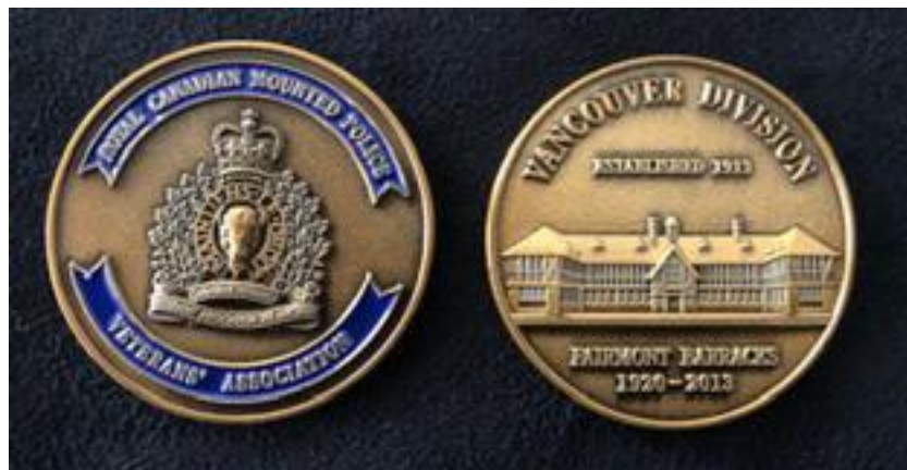
Figure 1 RCMP Veterans' Association - Vancouver Division Challenge Coin