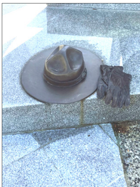
Detail of hat and gloves