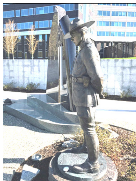
Profile view of pensive officer